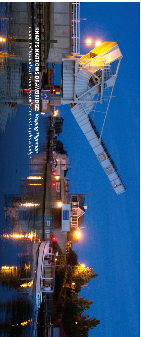
KNAPPS NARROWS DRAWBRIDGE: Keeping Tilghman connected to land is the nation's oldest operating drawbridge.

38 / D6 / Tilghman Area Youth Association / 410-886-2334 / 21374 Foster Ave. / tilghmanayta.org / After-school programs. Summer camps. Year-round events connect youth to self, family and community.